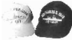
Item #6 Ball Cap

White hat with grey ship and gold lettering or Blue hat with gold ship and lettering with either