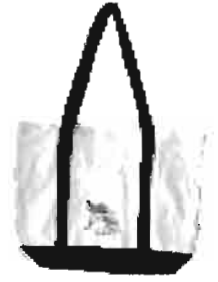
Item #3 Tote Bag Royal Blue/ Ash Ships Logo Pocket 14X17X5 $12.00

(please indicate hat color and silhouette preference)