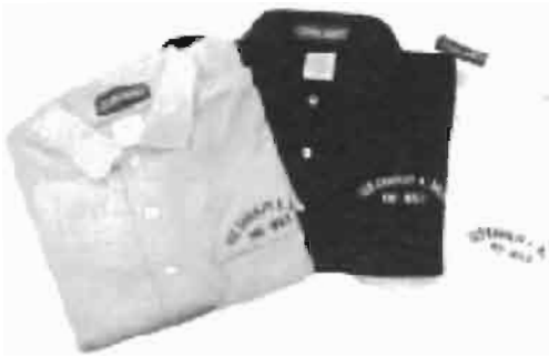
Item #1 Embroidered Golf Type shirts (with pocket)

Blue/ Gold Lettering White/Blue Lettering Tan/Blue Lettering